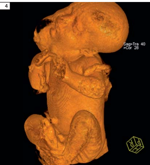
4 3D view of the fetus obtained by TrueFISP 3D.

software (Autodesk, San Rafael, CA, USA) [6, 7]. This program allows the virtual positioning of observation cameras while working with multiple on-screen windows. Since the development of the 3D model, the software has allowed the user to determine the best positioned viewpoints for visualization of the 3D model and also facilitated the adjustment of lighting parameters to improve contrast resolution. Using the navigation mode it is also possible to perform virtual bronchoscopy to visualize the upper respiratory tract from the pharynx downwards through the tracheobronchial tree with a quality similar to that obtainable by videotaped bronchoscopy.